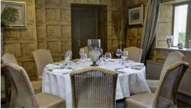
MEETING ROOM 1