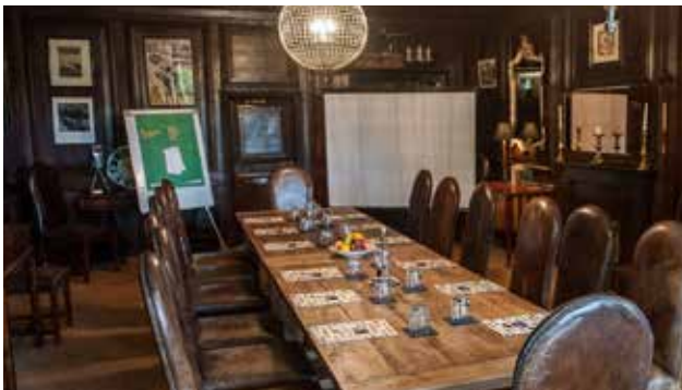
MEETING ROOM 3