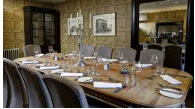
MEETING ROOM 2